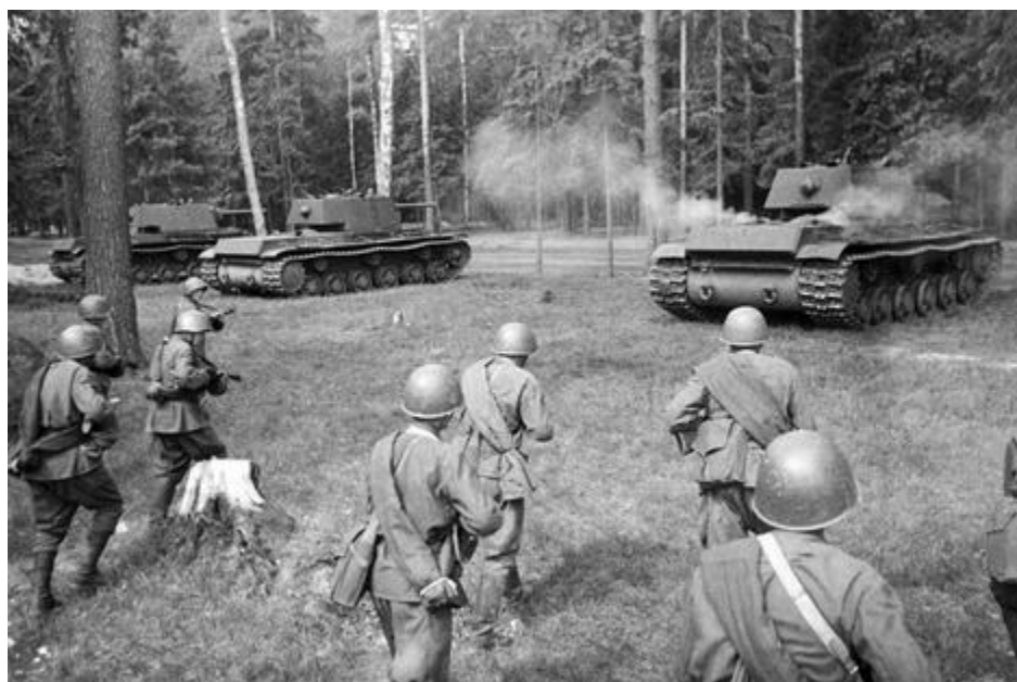
Soviet troops following heavy KV-1 tanks. The Western Front. May 13, 1942.