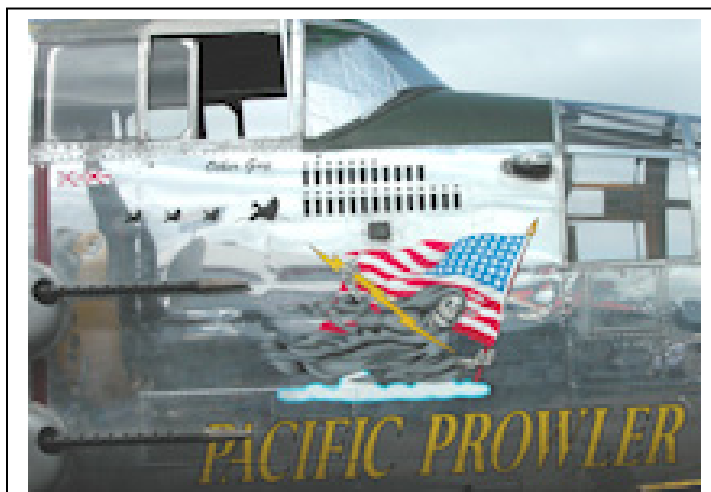
The name below the co-pilot window is: "Other Guy"