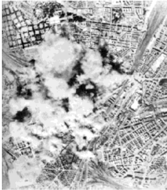
Figure 1. Pantelleria after aerial bombardment 85

In total, 3,647 sorties dropped 4,844 tons of bombs during the ten days of June. 86 Craven and Cate record that “At Pantelleria the conquest had been accomplished almost exclusively through air bombardment and surrender had come before the assault troops could contribute” as amphibious forces landed on the island on 11 June under the white flag. 87 “In the final analysis the morale of the defenders was the determining factor in the failure of Pantelleria to put up a strong and prolonged resistance.” 88 The main reason the island fell because it was possible to isolate it completely from mainland support, not solely because of the sheer weight of bombs. 89 Because the air forces had made Eisenhower’s experiment a walk-over, however, Pantelleria raised serious questions about comparing naval to aerial bombardment.