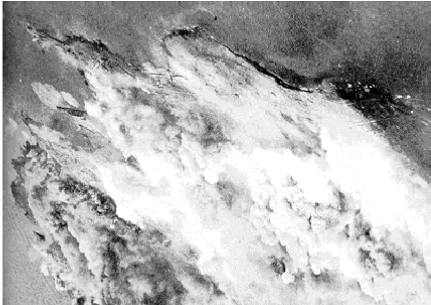
Figure 2. Rome after aerial bombardment 193